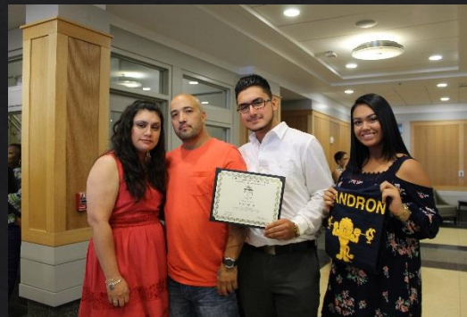
Closing/Student Recognition Ceremony