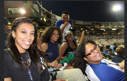
Trenton Thunder Baseball Game